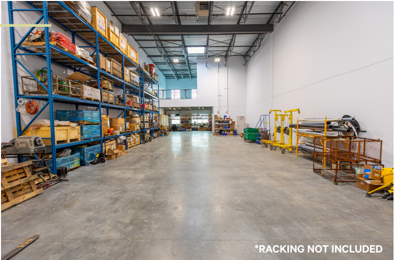
*RACKING NOT INCLUDED